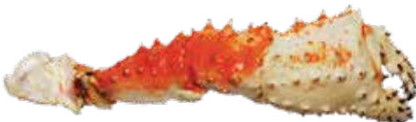
③ Killer Claw

Packed: 4.5 kg Carton Merus S (1-2 oz) (28-57 g) Merus M (2-4 oz) (57- 114 g) Merus 4up oz (114 g up)